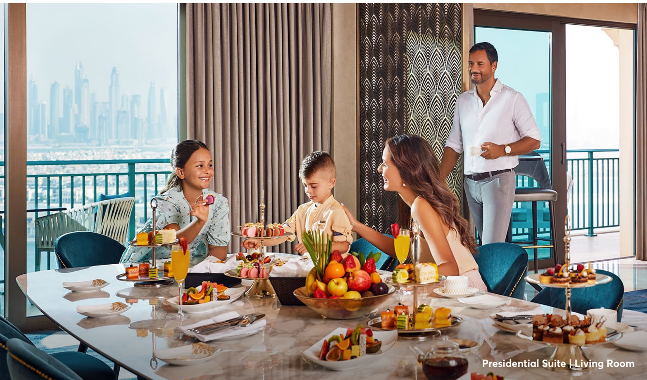
Presidential Suite | Living Room