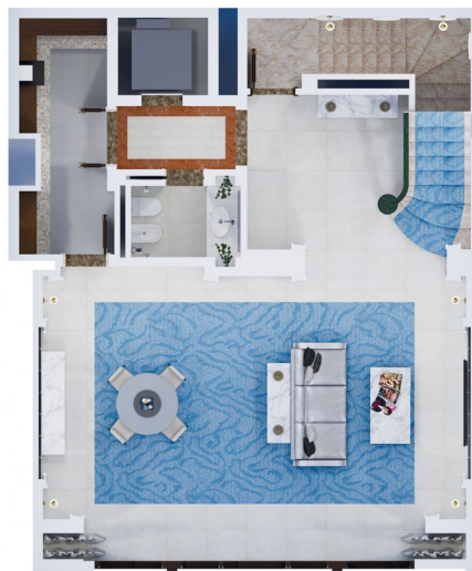
UNDERWATER SUITE 2F