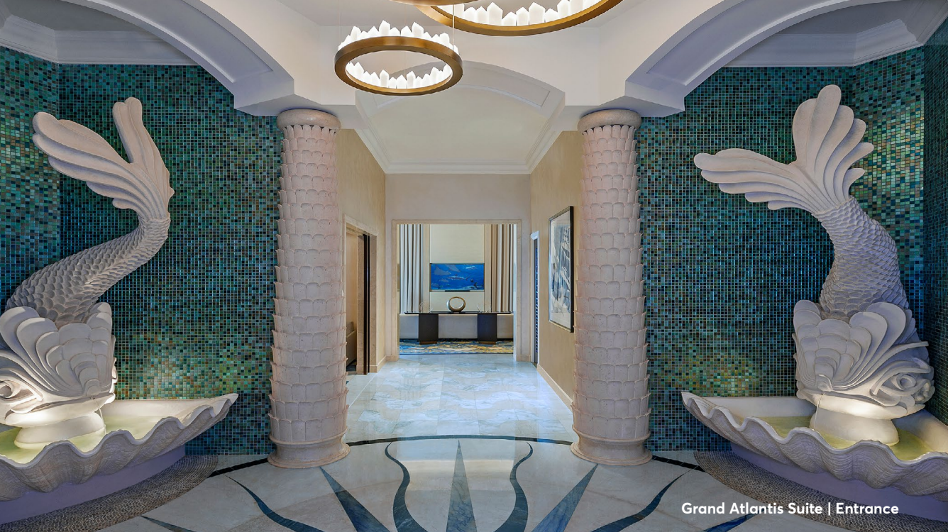
Grand Atlantis Suite | Entrance