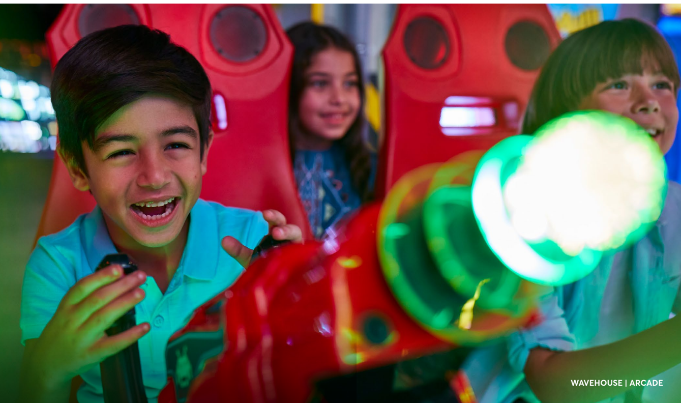
WAVEHOUSE | ARCADE

Kids can play at the best family entertainment destination in town with a complimentary AED 50 credit gaming card.