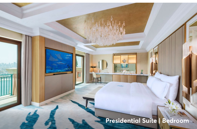
Presidential Suite | Bedroom