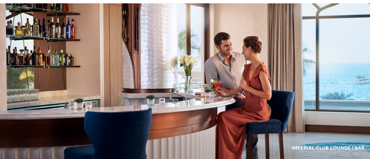
IMPERIAL CLUB LOUNGE | BAR