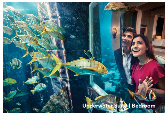
Underwater Suite | Bedroom