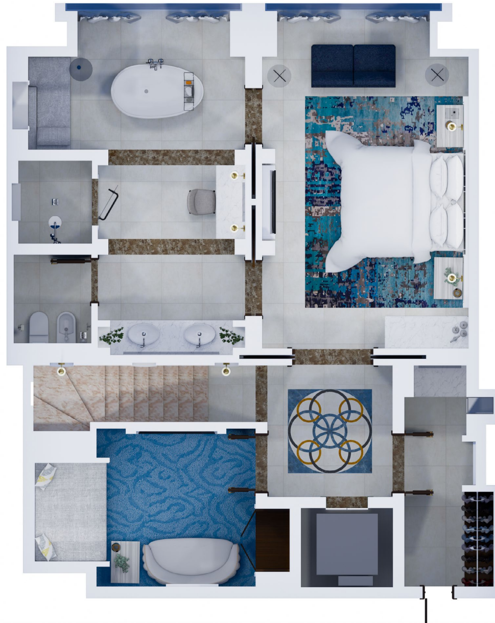
UNDERWATER SUITE 3F