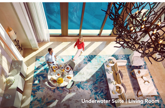
Underwater Suite | Living Room