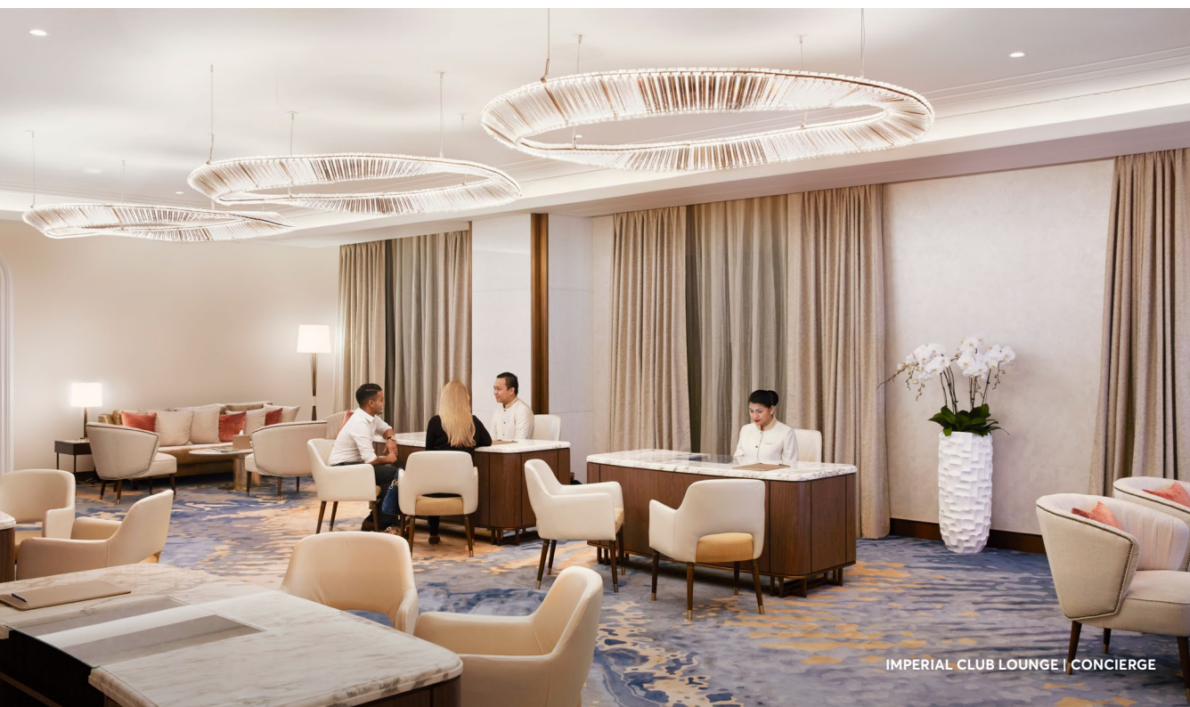
IMPERIAL CLUB LOUNGE | CONCIERGE

You can enjoy your holiday from the moment you arrive. Find a private check-in and check-out counter located in the Imperial Club Lounge for comfort and ease. Your luggage will be delivered straight to their room.