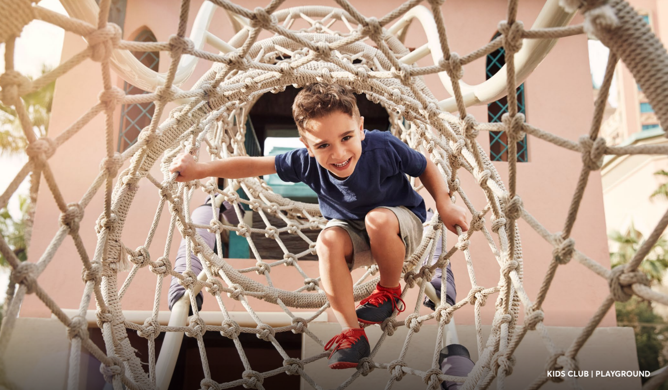
KIDS CLUB | PLAYGROUND