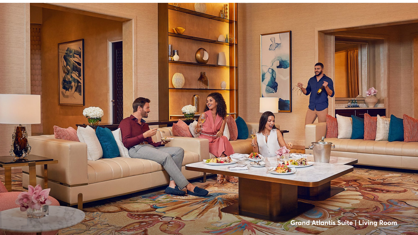
Grand Atlantis Suite | Living Room