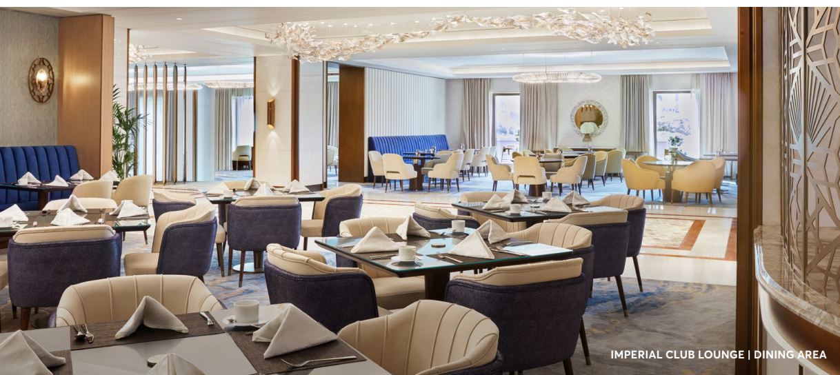
IMPERIAL CLUB LOUNGE | DINING AREA