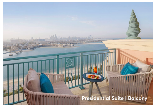
Presidential Suite | Balcony