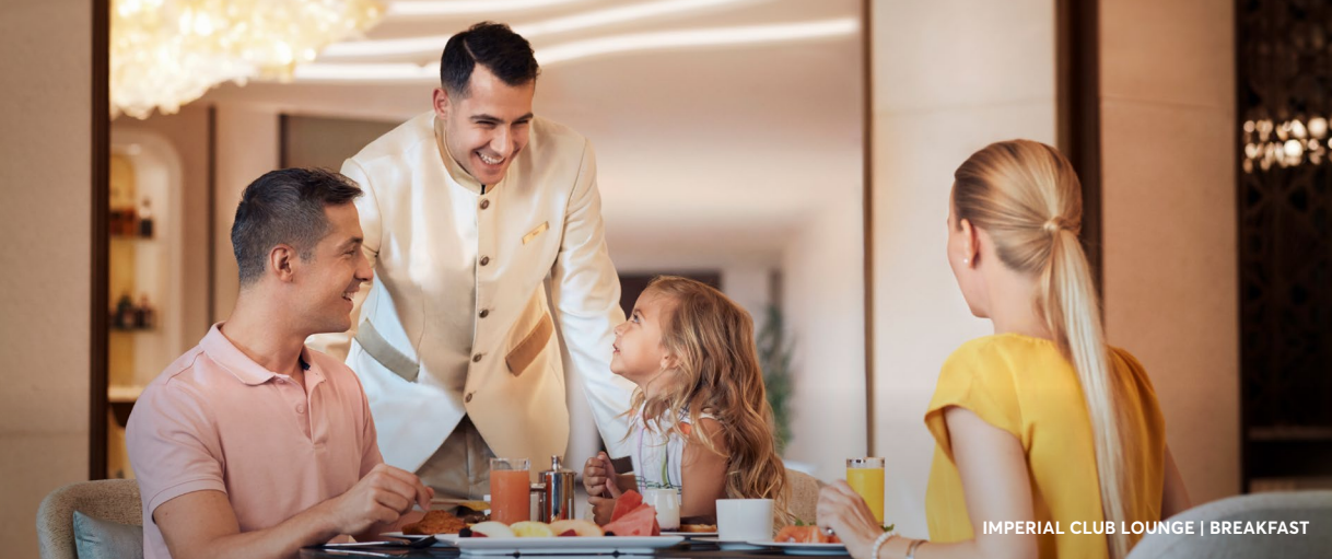
IMPERIAL CLUB LOUNGE | BREAKFAST