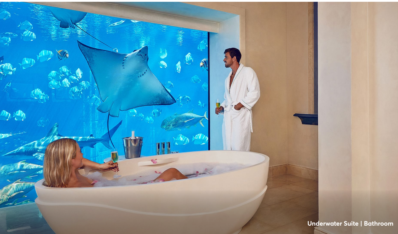
Underwater Suite | Bathroom