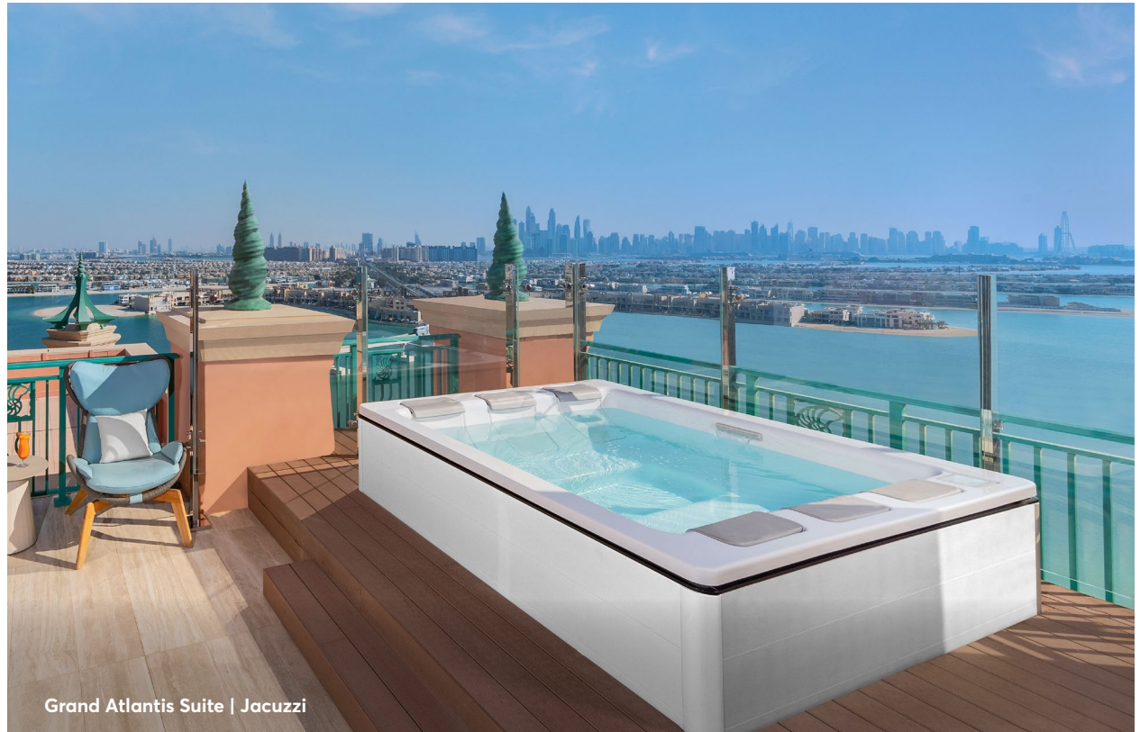
Grand Atlantis Suite | Jacuzzi

Whether it's a special occasion to celebrate or simply a magical getaway to indulge in, you will wakeup feeling extraordinary in a world of luxury.