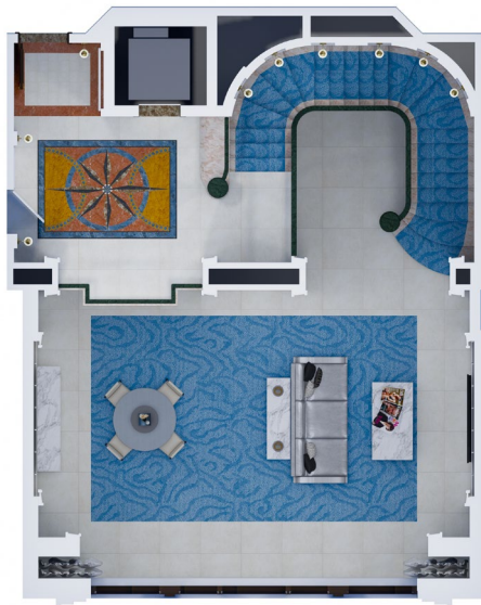
UNDERWATER SUITE 1F