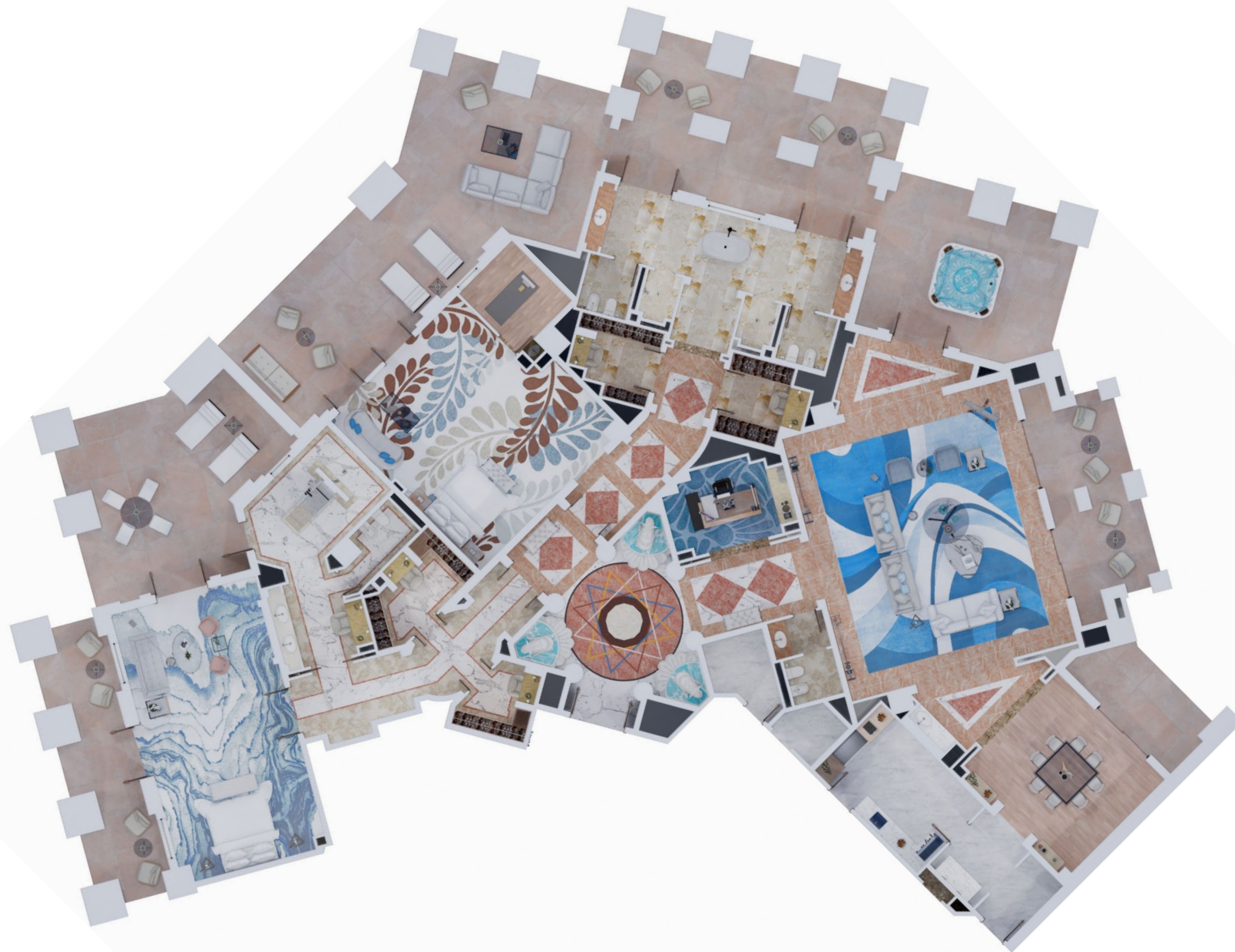
Grand Atlantis Suite