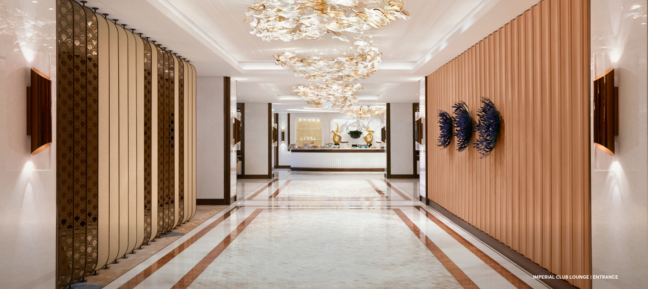
IMPERIAL CLUB LOUNGE | ENTRANCE